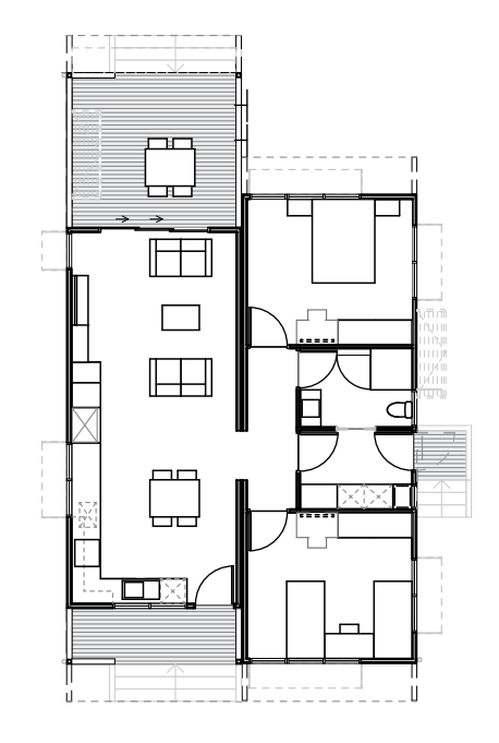
ALTERNATIVE FLOOR PLAN One bathroom only SCALE 1:200 at A4

Design remains the property of QBuild. Any use for commercial purposes without written permission prohibited.